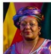
H.E. SIA NYAMA KOROMA First Lady of the Republic of Sierra Leone