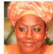
H.E. FATOU LAMIN FAYE Minister of Basic and Secondary Education of The Gambia