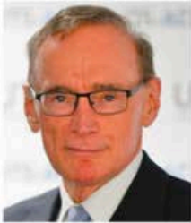
Hon. Prof. Bob Carr Former Foreign Minister of Australia