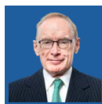
Hon. Prof. Bob Carr