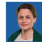
H.E. Charlotta Schlyter

Representative of the Minister of Education (CHILE)