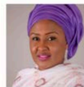
H.E. AISHA BUHARI Wife of the President of Nigeria