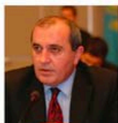
H.E. BESNIK MUSTAFAJ Fr. Minister of Foreign Affairs (Albania)