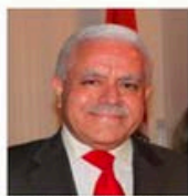
H.E. ASHOK SAJJANHAR Former Ambassador of India to Kazakhstan, Sweden and Latvia