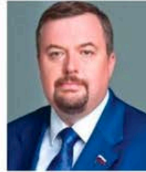
Anton Morozov Member of the High Council of the LDPR, Deputy of the State Duma | Russia