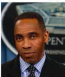
JJ Green National Security Correspondent, WTOP Radio | USA