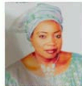
HON. NDEYE AWA MBODJ Member of the Committee on Foreign Affairs (Senegal)